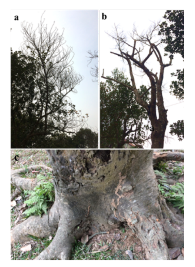
Figure 1. Symptoms of Jackfruit decline (a) partial die back observed in an infected plant, (b) complete death of infected plant, and (c) canker at the collar region and trunk of infected plant

tophthora spp. were identified based on their morphological characters described by Borines et al. (2013). The papillate lemon shaped sporangia (Fig. 2) developed in both soil bait (rose petal) and onion agar are the major morphological characteristics of isolates. All the isolates were showing similar characteristics. Therefore, they were named as Phytophthora spp. All three isolates of Phytophthora spp. infected